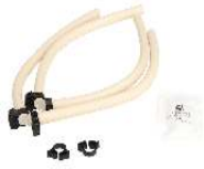
TUBE KIT, .188 PUMP LCC/LCA