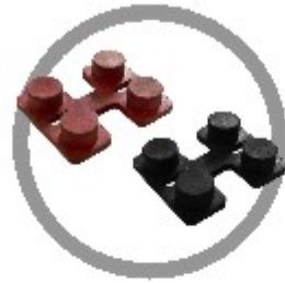
Two pieces minimum for each joint