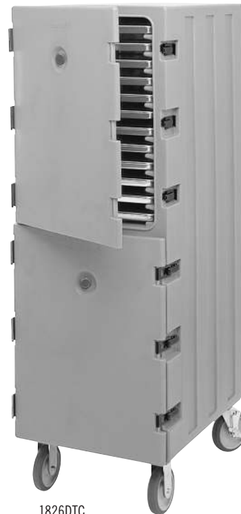
1826DTC (For Trays & Sheet Pans)