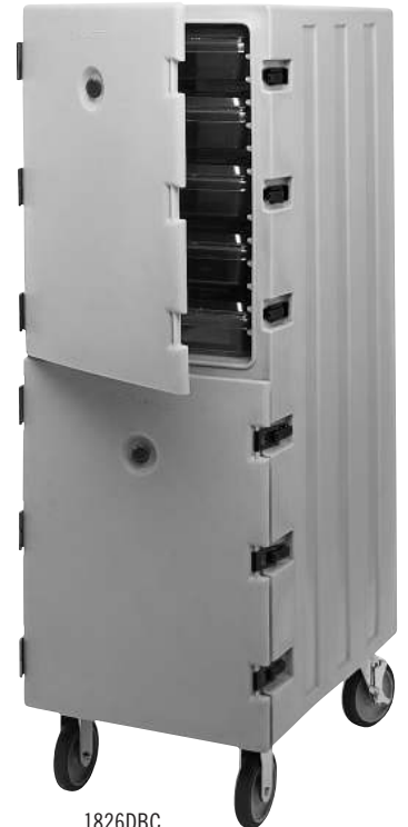
1826DBC (For Food Storage Boxes)